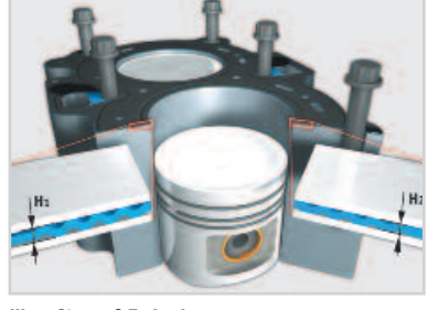
Wave-Stopper® Technology Topographic adaptation of Wave-Stopper technology provides selective functional control.

Depending on the functions that cylinderhead gaskets must perform, they are fitted with different functional elements. These elements represent the freedom of design that defines MLS head gaskets.